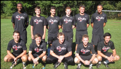
Team of 2011